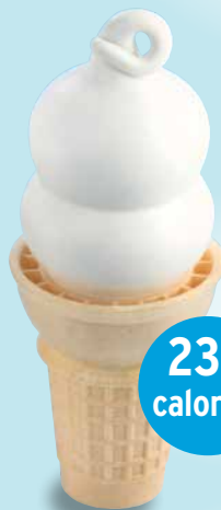
DQ® Small Vanilla Cone