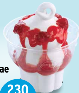
DQ® Small Strawberry Sundae